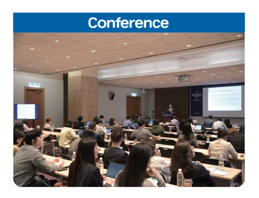
32 Sessions, 170+ Speakers