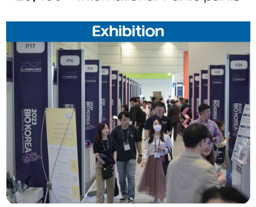
440+ Booths, 330+ Companies