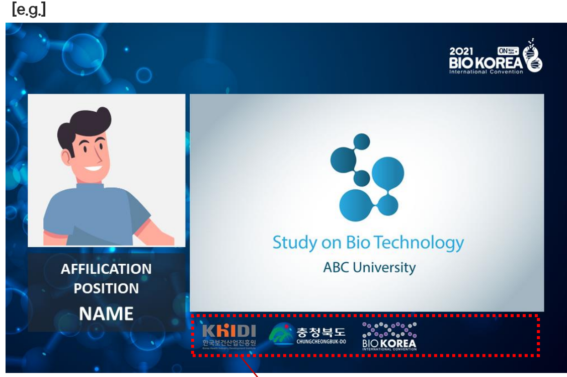
Logo exposure on bottom of e-conference